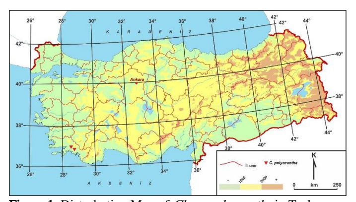
Figure 1. Distrubution Map of Chara polyacantha in Turkey

light green. Internodes 2-3 times longer than the branchlets. The branchlets are 8-10, each with 6-9 segments, the upper 2-3 are ecorticated (without cortex). The stem cortex is diplostichous, sometimes irregular: triplostichous or isostichous, the primary rows always prominent, strongly tylacanthous. The spine cells are commonly in bunches, same long or longer than the axis diameter. Prominent spine cells dense along the axis especially upper parts and younger internodes. The stipulodes are well developed in both rows, the cells in the upper and lower row are equal length, usually as long as the axis diameter. The bract cells are 5-7. The bracteoles are longer than the oogonium. The species is monoecious. Gametangia are conjoined at the lowest branchlet nodes. The oogonium is 900-1000 long 500-600 µm wide. The oospores are dark brown to black. Antheridia are solitary and 300-500 µm in diameter (Figure 2).